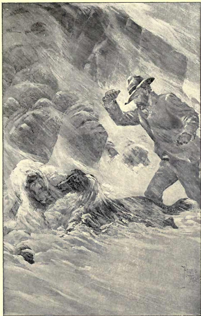
The next instant a bearded face appeared from the folds of a heavy fur overcoat.